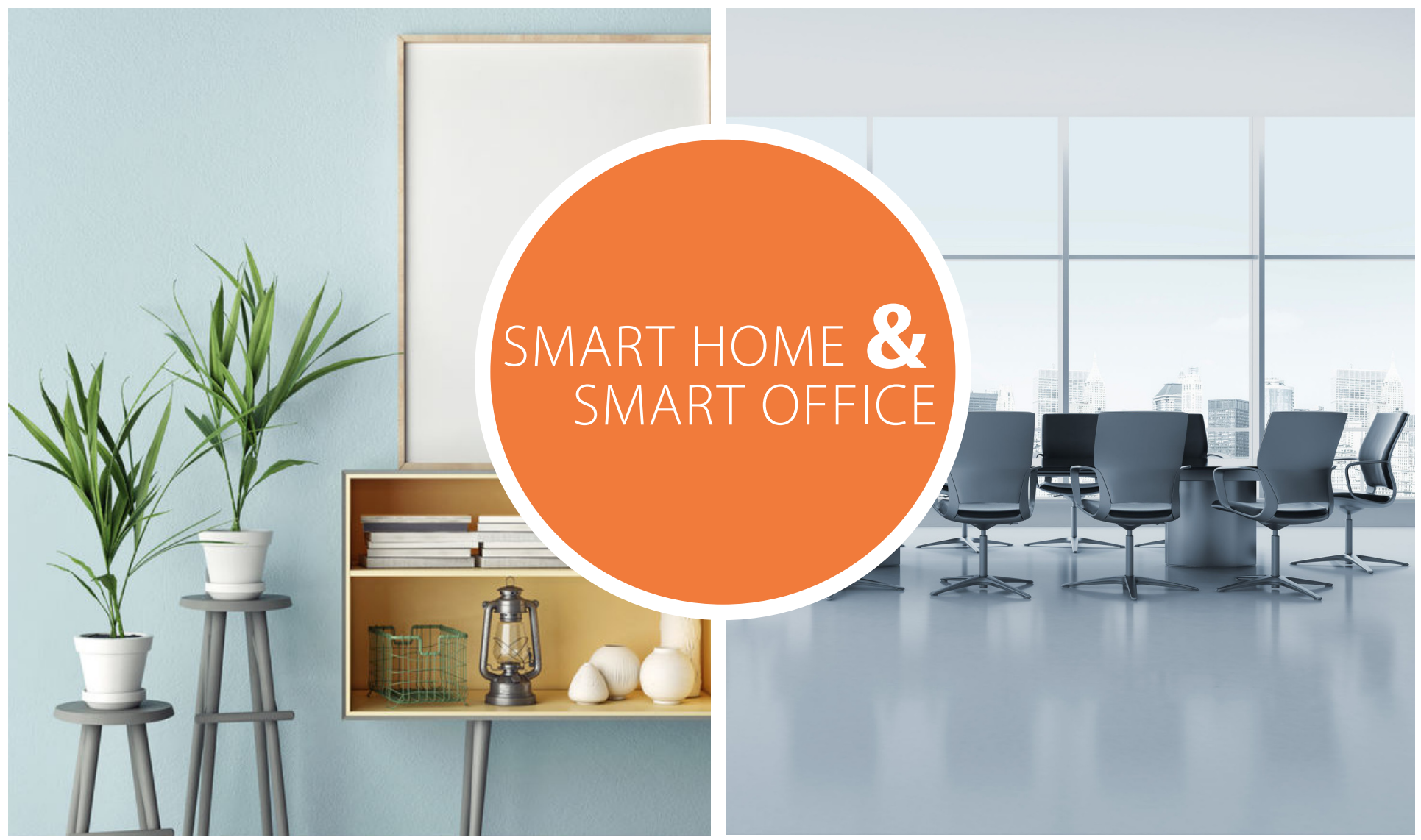
SECURITY & AUTOMATION PRODUCT CATALOGUE